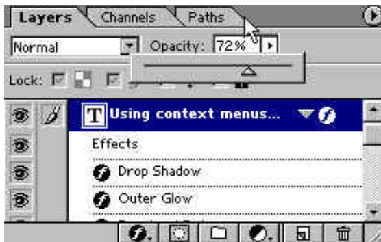
Example of a slider bar.

To cancel values before you apply them, press the Escape key .